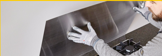
19. SEALING AND BONDING HYGIENIC CLADDING BOARDS