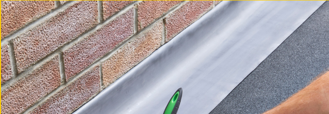
17. SEALING AND BONDING OF LEAD SHEETS.