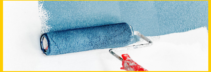
21. APPLICATION PRIOR TO PAINTING