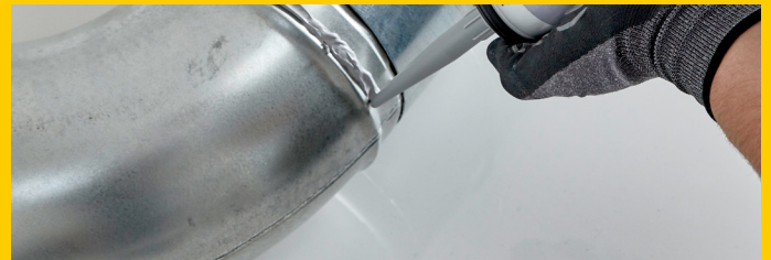
24. SEALING & BONDING DUCT WORK