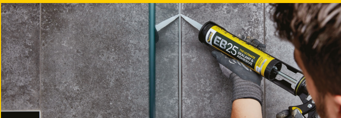
20. BONDING DECORATIVE SHOWER PANELS