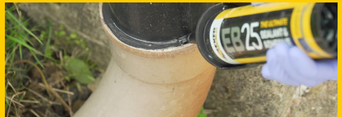
23. JOINTING LEAKING WASTE PIPES AND GUTTERS