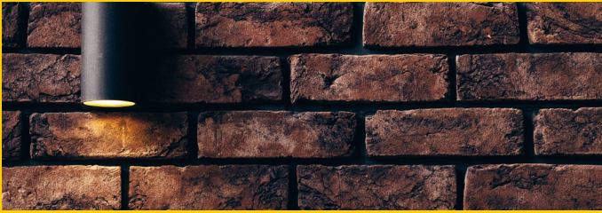
16. BONDING BRICK SLIPS