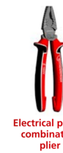
Electrical power combination plier

Ergonomic handles: High-quality plastic ensures a secure grip