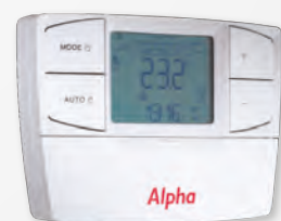
Comfort 2-Channel Control Part Number: 3.022142

We recommend this is fitted with Climatic Control.