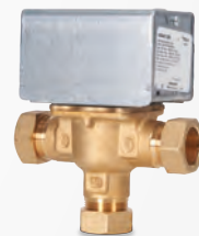
Three-Way Diverter Valve Kit Part Number: 6.5500048

We recommend this is fitted with Climatic Control.