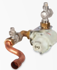
PremierPack Extra Part Number: 3.028667