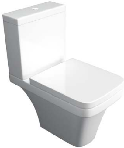
ILLUSTRATION: KAREENA C/C PAN & CISTERN

CODE: C/C WC PAN - POT405SI C/C CISTERN - POT401SI SOFT CLOSE SEAT - POT402SI