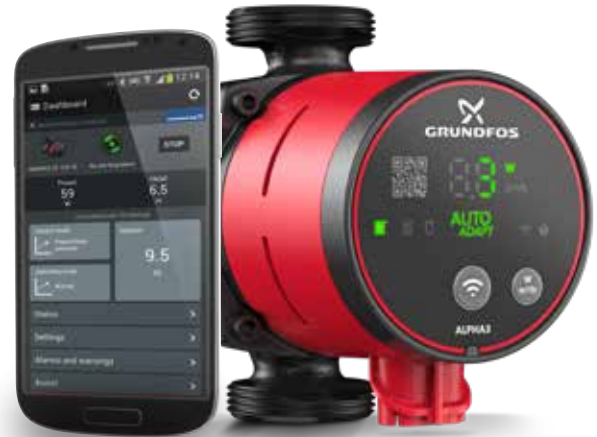
PRODUCT CODE 99371966

Now you're no longer limited to the information available on the pump's display. With a smartphone, you get instant guidance and detailed data in an easy and intuitive way. And it's never been easier to report and send your findings via the Grundfos GO REMOTE app's reporting options.