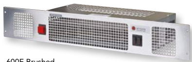
600E Brushed Stainless Steel*