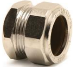
K651CP Stop End

Stop end. Body may be removed at any time and another Kuterlite fitting used with the same nut and compression ring