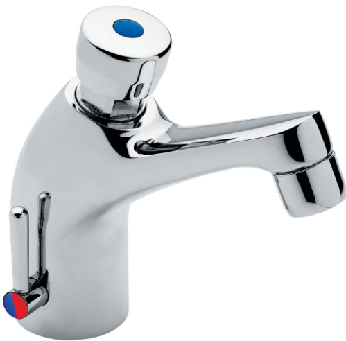
non concussive basin mounted tap adjustable temperature control NC180CP