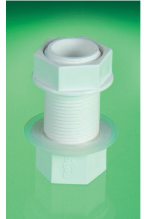
OS14 STRAIGHT TANK CONNECTOR

Fits both pushfit and solvent weld systems