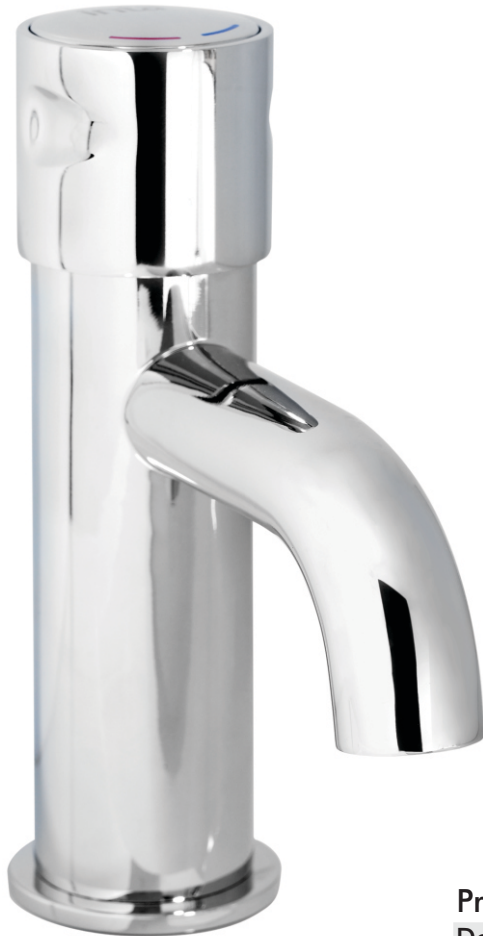
non concussive basin mounted manual mixer tap NC230CP

The Non Concussive basin mounted tap with Adjustable Temperature control is designed for use with the Inta range of Thermostatic Mixing Valves. The tap is operated by manually pressing the control knob, the non concussive action automatically closes the tap after approximately 15 seconds. Rotating the control knob clockwise or anti-clockwise reduces or increases the mixed water temperature.