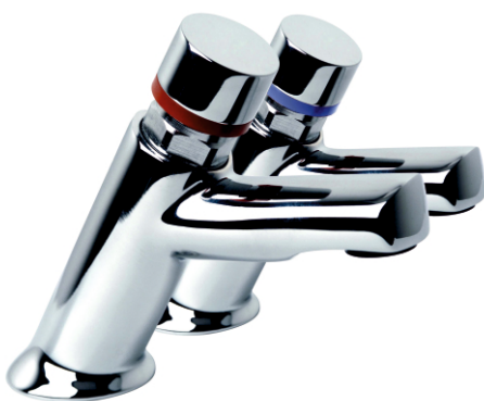
non concussive basin mounted tap (pairs) NC162CP