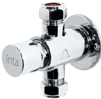
Time Flow Shower Exposed TF997CP

Water conservation is essential and in some public establishments where multiple water outlets are used, the Inta range of Time Flow Control systems are an eco-friendly, stylish and economical solution to the problem of water wastage. All of the Inta Time Flow Controls are designed to work with the Intamix range of the Thermostatic Mixing Valves