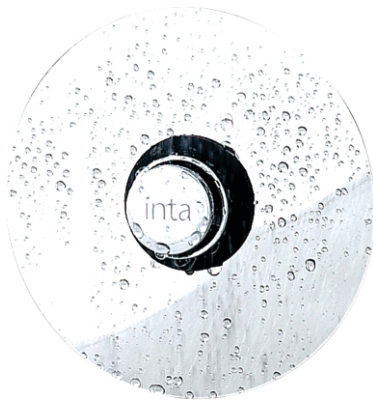
Time Flow Shower Concealed TF997CP