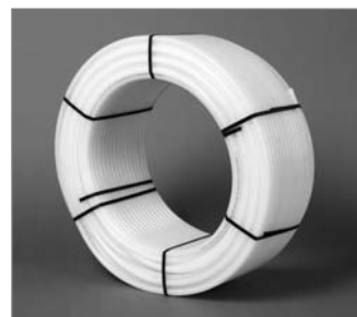
Underfloor heating pipe