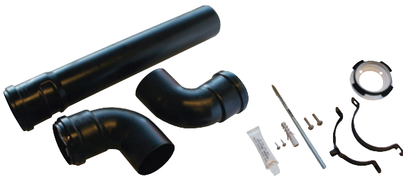
Plume Management Kit