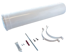
Internal 600mm 80/125 flue extension