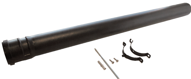
1 metre extension