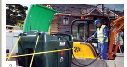
1. Agricultural application 2. Industrial application 3. Construction application