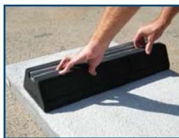
2. Place both feet on the light weight slab to match the pitch of ASHP feet.