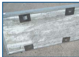
3. Insert all 4 base plates through the light weight slab and reposition to the required location of the ASHP unit.