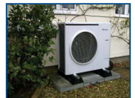
5. Secure the ASHP units onto the kit - the installation is complete.