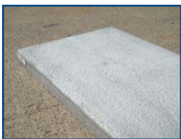
1. Position the light weight slab in the required location of the ASHP unit.