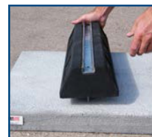
4. Place both feet onto the threads and secure with nuts and washers.