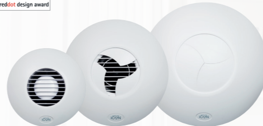
iCON 15 iCON 30 iCON 60