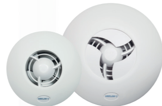
iCONsmart 15 iCONsmart 30