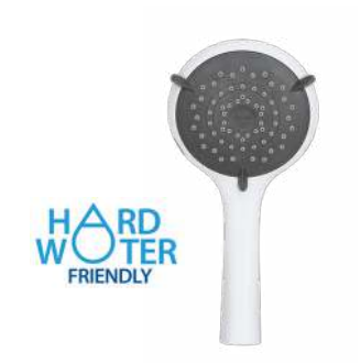
Inclusive Showerhead TSHECAREWHT