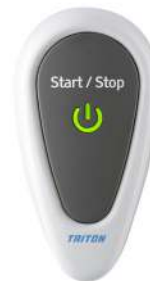
Remote Start / Stop CSGPRSS