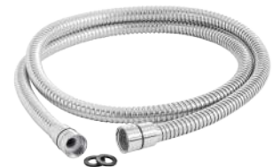
2m Anti-twist Hose - Chrome TSHG1266