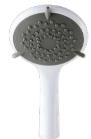
Inclusive Showerhead (5 Spray Pattern) TSHECAREWHT