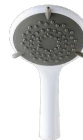
Inclusive Showerhead (5 Spray Pattern) TSHECAREWHT