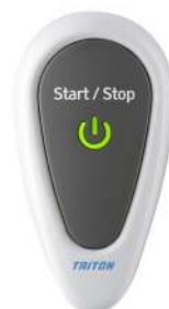
Remote Start / Stop CSGPRSS

Replacing specified Triton accessories for this Omnicare unit will aid optimum performance and keep the unit within the allocated guarantee period