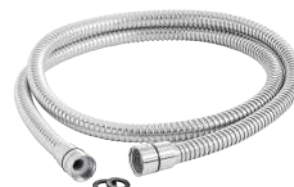
1.5m Anti-twist Hose - Chrome REHOSE150C