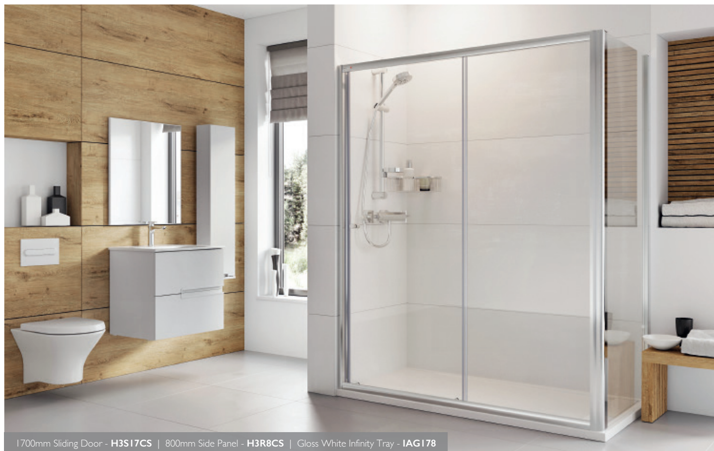
1700mm Sliding Door - H3S17CS | 800mm Side Panel - H3R8CS | Gloss White Infinity Tray - IAG178