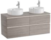
Base unit with four drawers for two On Countertop basins