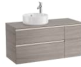
Left hand base unit with two drawers and one door for On Countertop basin