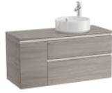
Right hand base unit with two drawers and one door for On Countertop basin