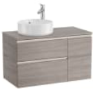
Left hand base unit with two drawers and one door for On Countertop basin