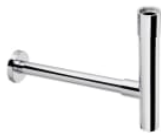
1 1/4" outlet connector for basin. 300 Pipe